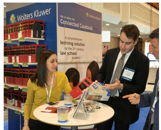
The AALS Annual Meeting is the world's largest gathering of legal educators. The event attracts over 3,000 law school faculty members, deans, and law librarians from the U.S. and other countries.

Let us know about your special event to promote your product and services so we can publicize it on our website, on our mobile app and in the meeting program. Let registrants know about your offerings before the Annual Meeting starts.