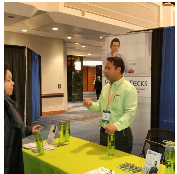
Meet authors and pursue new ones, present your new titles and market your list of books in the largest gathering of the legal academy.