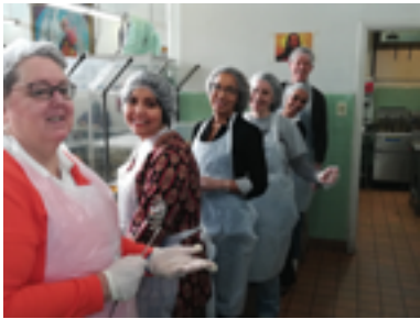
Service project at Ozanam Inn Co-Sponsored by the Poverty Law Section

Ozanam Inn is a non-profit, direct service agency serving the homeless and needy of greater New Orleans. While the Inn's immediate priority is to offer aid and comfort by providing for basic needs like food, shelter and clothing, they also offer case management and counseling to help move individuals from homelessness to independent living. Volunteers served a midday meal at the Inn. You can tell from the photos that we had a blast!