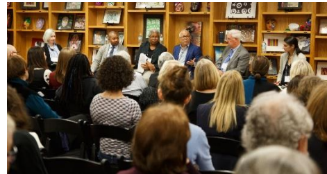
A roundtable on Responding to Community Needs Through Partnership.

On April 5 th the WilmerHale Legal Services Center celebrated their 40 th anniversary , commemorating their work meeting the community's legal needs, training the next generation of lawyers, and fostering social change.