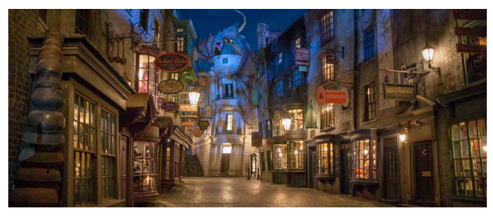
The AALS Midyear Meetings will be held in Orlando, Florida, near the newly opened Wizarding World of Harry Potter.

A concluding session jointly sponsored with the Workshop on Next Generation Issues of Sex, Gender and Law will also cover marriage equality and inequality. During concurrent sessions, participants will explore family law's relationship to other areas of law, differing approaches to family formation, and pedagogy and practice.