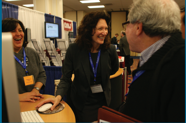
We appreciate all of our vendors very much.