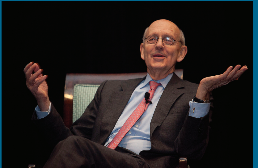
A Conversation with Justice Stephen Breyer