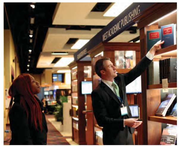
AALS Exhibit Hall