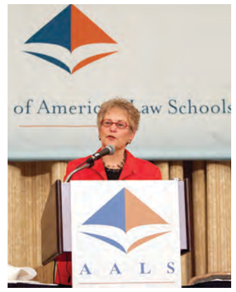
Deputy Undersecretary of the Department of Education Jamienne Studley