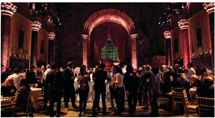
AALS Gala Reception