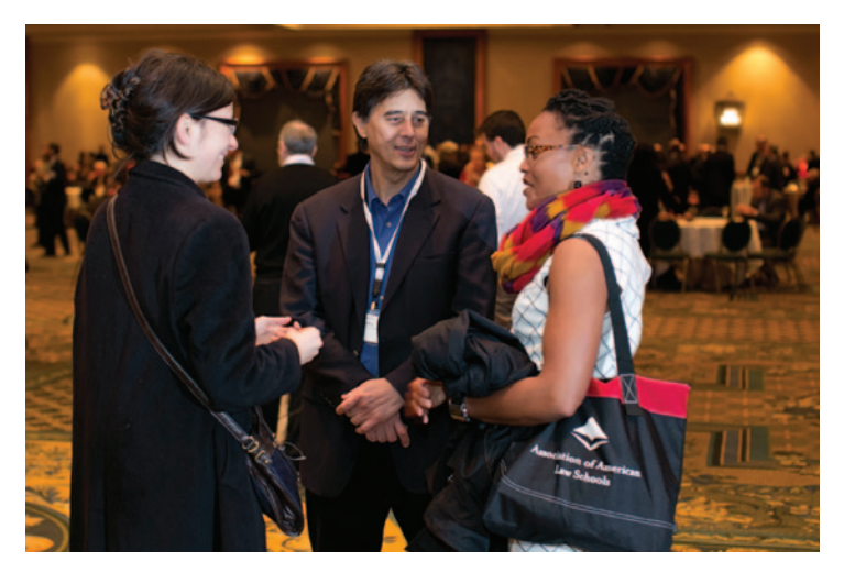
Attendees enjoying the AALS Gala Reception at the Hilton New Orleans Riverside Hotel