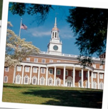
Mercer Law School