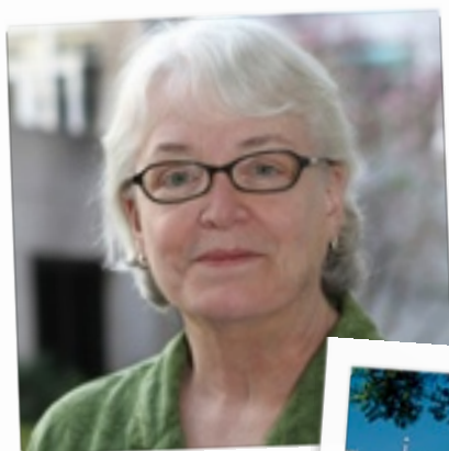
Martha Albertson Fineman

On April 15-16, 2011, Mercer Law School hosted the Southeast Regional Legal Writing Conference. The two-day conference, Opening the Lens: Re-Visions in Legal Writing Teaching, Theory, & Practice, explored interdisciplinary theories and practice perspectives as a way to encourage participants to look again at their teaching, scholarship, and service. The opening colloquium, which featured internationally known law and society scholar, Martha Albertson Fineman, illustrated the use of feminist and other critical theories to enrich legal writing teaching and scholarship. In addition to Professor Fineman, the opening colloquium brought together a panel of leading legal writing and clinical professors who discussed the relationship of critical theories to law school teaching, legal scholarship, and professional service. On the second day of the conference, concurrent sessions included presentations on interdisciplinary and other approaches legal writing and lawyering skills professors use to integrate theory and practice within their teaching, scholarship, and service. Preceding the conference, Mercer hosted an ALWD Scholars' Forum & Workshop through a grant from the Association of Legal Writing Directors.