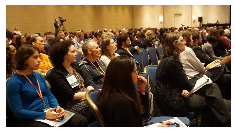
Conference attendees enjoy the Opening Plenary Session.